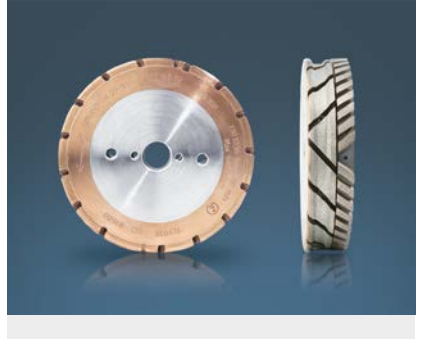
We took a leap forward in laminated glass grinding with our REVERSE wheels, simplifying grinding operations, improving yields and the processing quality while equally reducing stress to the tool and the workpiece.