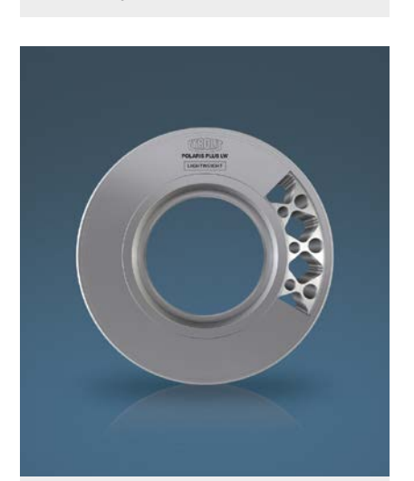
Our patented lightweight core technologies enable us to improve customers' precision grinding processes, saving them time and money. This is possible through computer-calculated targeted material reductions or the use of natural fibres.