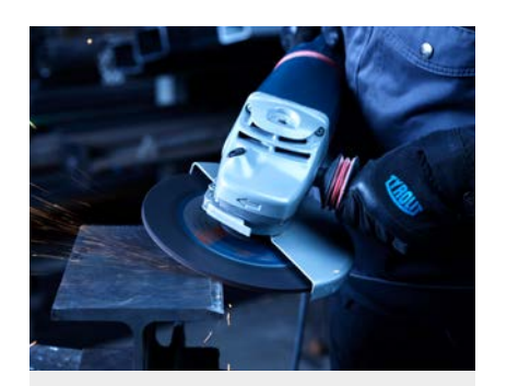
With CERABOND X , TYROLIT sets a milestone in the abrasives market. The combination of ceramic grain and the unique TYROLIT bond system enables consistent cutting ability of the discs, combined with unique durability.

A passion for technology, many years of experience and a strong innovative spirit have been incorporated into the manufacture of outstanding grinding solutions.