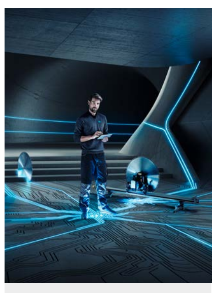
MoveSmart is a novel monitoring system for the construction industry, connecting TYROLIT machines to the Internet of Things and processing user data directly on site and in real-time. A smart move into the future.