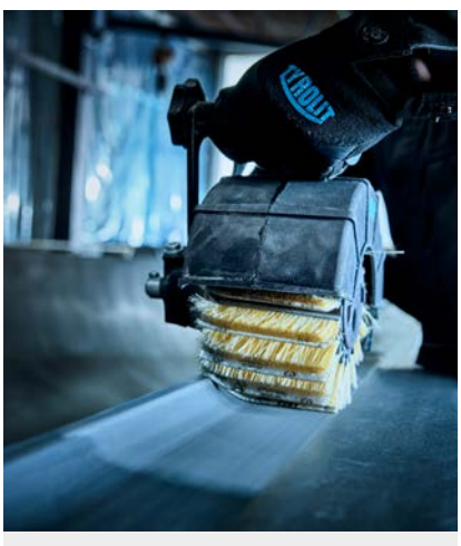
TYROLIT Power revolutionised the finishing of hard surfaces. Sanding strips consisting of layers made from cactus hair and diamond provide extreme hardness, save time and significantly reduce vibrations for the user.